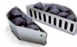
Charcoal Baskets 7403 - Pair

For the complete range of Weber accessories visit www.weber.com