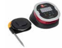
iGrill® 2 Featuring a digital LCD display, total control of your barbecue meals has never been easier. 7203