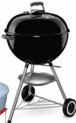
The 2019 Original Kettle™

For nearly 30 years we've recommended that our kettle owners buy 'The Complete Australian Barbecue Kettle Cookbook'. We know it ensures that you will become a master Weber kettle chef. That's why these days, not only do we recommend the book, we include it with all of our 57 cm kettles. It's our guarantee of your success. We think there's probably no better product handbook in the world.