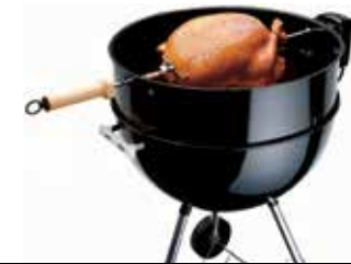
57 cm Kettle Rotisserie For the Weber range of 57 cm kettles, features a heavy duty electric motor and a wooden handle. 8493