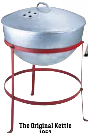
The Original Kettle 1952