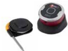
iGrill mini Take the guesswork out of barbecuing with the iGrill Mini digital Bluetooth® thermometer. 7202