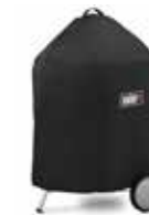
Deluxe Weatherproof Covers 7150 - 57cm Cover 7151 - Performer™ Cover 7152 - Performer Premium Cover