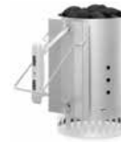
Rapidfire™ Chimney Starter The easy way to get charcoal fired up and ready to use quickly. Ready to cook on in 20-25 minutes. 7419