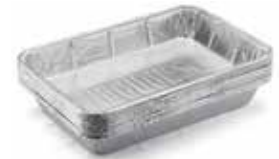
Large Drip Pan - Pack of 10 Especially designed for barbecue use. Made to the highest quality without any sharp edges. 6416