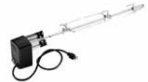
Gas Barbecue Rotisseries Rotisserie to suit Spirit II 8518