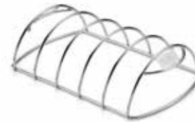
Weber Rib Rack Heavy gauge, nickel plated steel rib rack creates up to 50% more usable cooking area. 6605