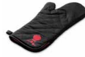
Barbecue Mitt Black with Kettle Motif Has a special flame retardant coating to protect you from the heat of your barbecue. 6532