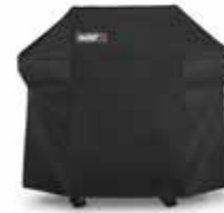
Full Length Covers Spirit II series 7139

For the complete range of Weber accessories visit www.weber.com