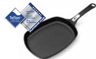
Weber Ware Frying Pan Large Platinum Teflon® coated easy to clean surface and the detachable handle. 17725