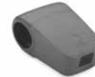
Grill-Out™ Handle Light 7516